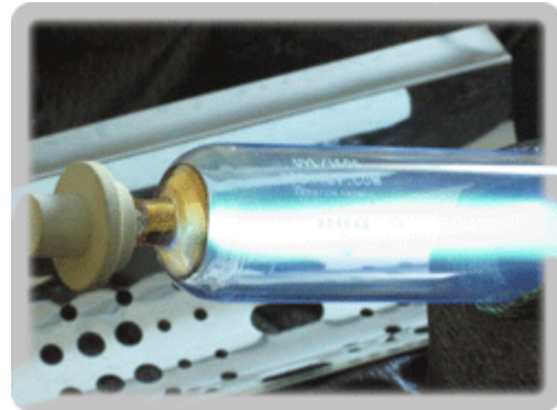
SPDI lamps are designed for reliability and performance

We design and manufacture a wide selection of UV lamps and reflectors, as well as complete UV systems.